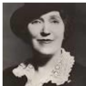
Sonor Smart Dodd