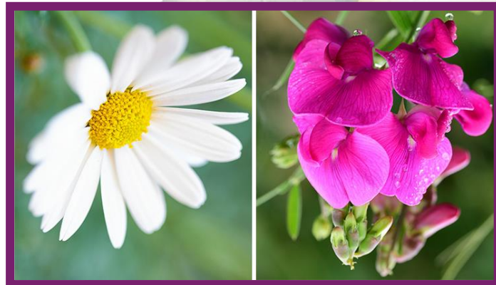
April Flowers of the Month: Daisy and the Sweet Pea!